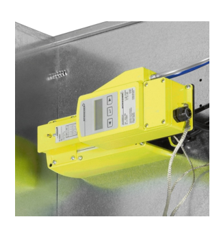
ATEX-COMPLIANT PARTS AND UNITS