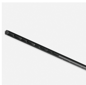
INSTALLATION IN CONTINUOUS CEILINGS