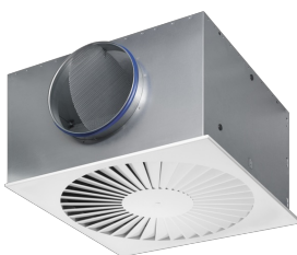
SQUARE DIFFUSER FACE WITH SQUARE PLENUM BOX

Circular diffuser faces with circular plenum box