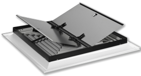
WITH BUTTERFLY DAMPER