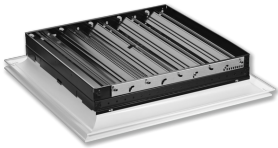
WITH DAMPER BLADE