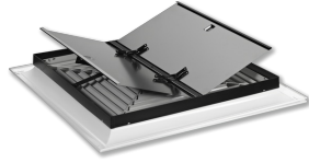
WITH BUTTERFLY DAMPER