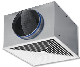
WITH PLENUM BOX