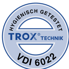
TESTED TO VDI 6022