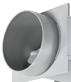
VARIANT WITH CIRCULAR SPIGOT