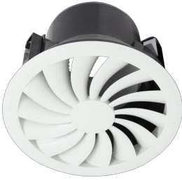
Circular swirl diffuser with spigot for connection to a vertical duct