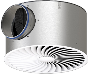
Circular face style with circular plenum box