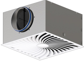
Square face style with square plenum box