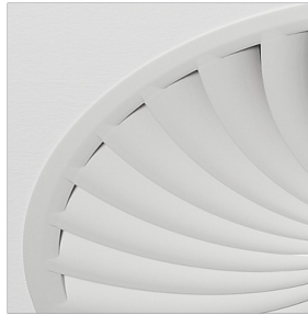
Gently sloped, flat border (shown in a continuous ceiling)