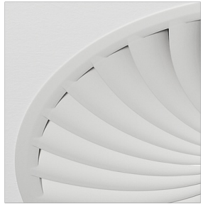
Gently sloped, flat border (shown in a continuous ceiling)