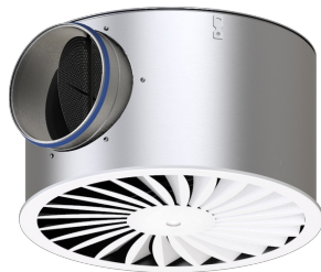
Circular diffuser faces with circular plenum box