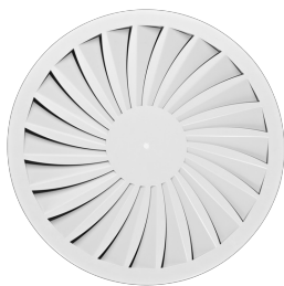
Round diffuser face