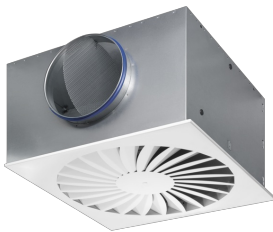
Square diffuser face with square plenum box