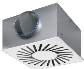
Square diffuser face with square plenum box