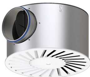
Circular diffuser faces with circular plenum box