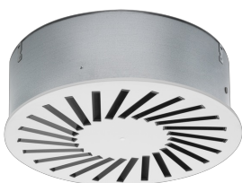
Circular face style with circular plenum box and top entry spigot