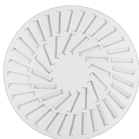
Circular diffuser face with white air control blades